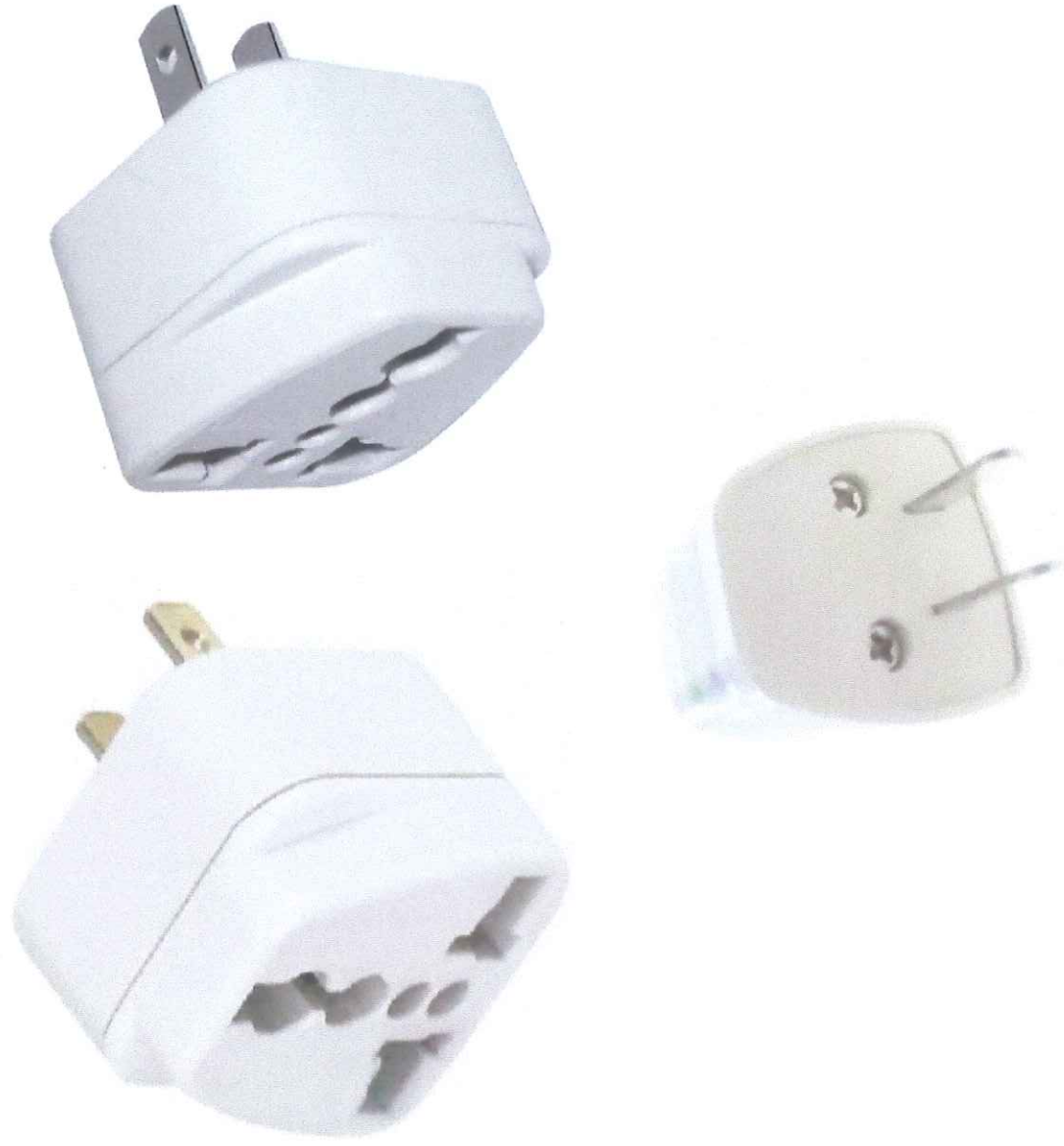
Universal Adapter Plug AC Socket Converter Adaptor